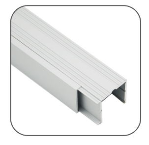
Alu Profile (Back)